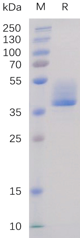
Figure 1. Human BAFF-R Protein, hFc Tag on SDS-PAGE under reducing condition.