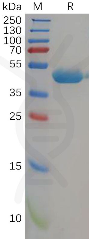
Figure 1. Human CD112 Protein, His Tag on SDS-PAGE under reducing condition.