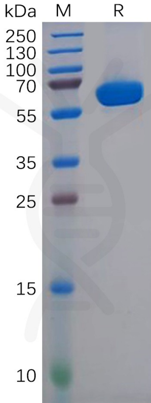
Figure 1. Human CD2 Protein, hFc Tag on SDS-PAGE under reducing condition.