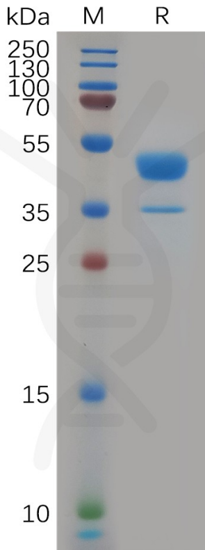
Figure 1. Human CXCR2 Protein, hFc Tag on SDS-PAGE under reducing condition.