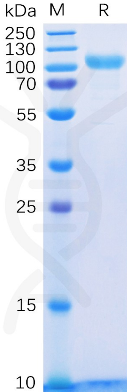
Figure 1. Human HER3 Protein, His Tag on SDS-PAGE under reducing condition.