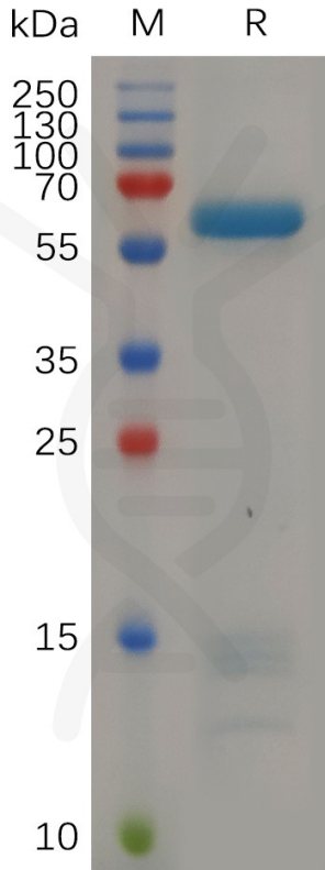
Figure 1. Human IGFBP7, N-hFc Tag on SDS-PAGE under reducing condition.