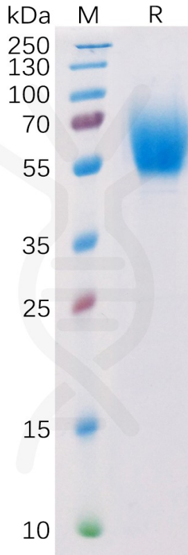
Figure 1. Human IL13RA1 Protein, His Tag on SDS-PAGE under reducing condition.