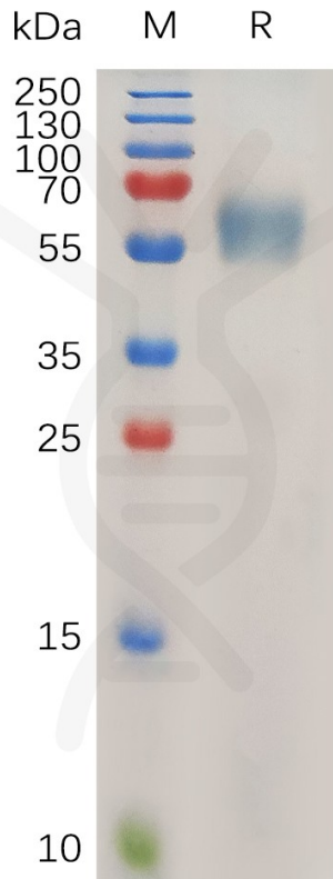
Figure 1. Human IL1RAP Protein, His Tag on SDS-PAGE under reducing condition.