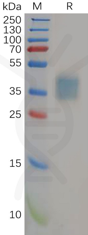
Figure 1. Human IL21R Protein, His Tag on SDS-PAGE under reducing condition.