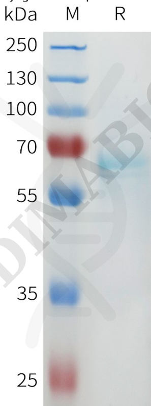
Figure 2. Biotinylated Human CD4-Nanodisc, Flag Tag on SDS-PAGE