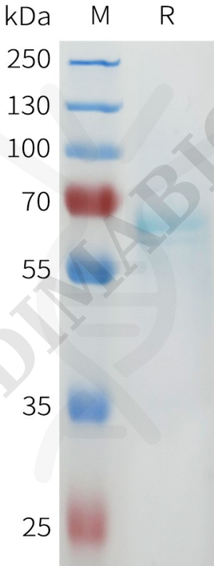
Figure 2. Biotinylated Human CD4-Nanodisc, Flag Tag on SDS-PAGE