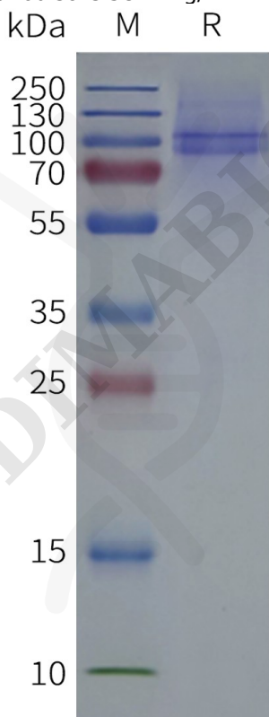
Figure 2. Biotinylated Human FSHR-Nanodisc, C-Flag&Avi Tag on SDS-PAGE