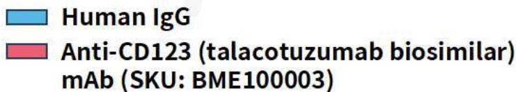
Figure 1. Flow cytometry analysis of human CD123 overexpression using Hu_CD123 K562 Cell Line (Cat. No. CEL100011) and Anti-CD123 (talacotuzumab biosimilar) mAb (Cat. No. BME100003)