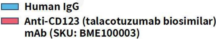
Figure 1. Flow cytometry analysis of human CD123 overexpression using Hu_CD123 K562 Cell Line (Cat. No. CEL100011) and Anti-CD123 (talacotuzumab biosimilar) mAb (Cat. No. BME100003)