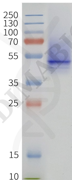
Figure 2. Human 5HT1B-Strep-Nanodisc, C-Flag&Strep Tag on SDS-PAGE