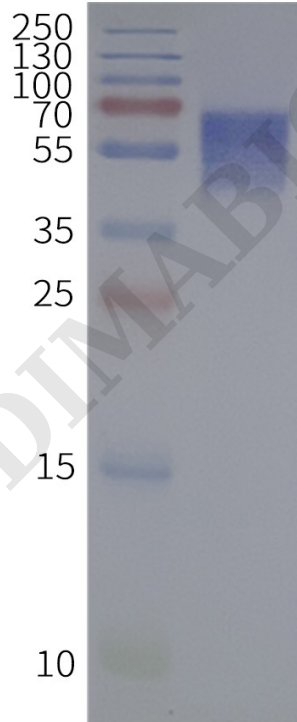
Figure 2. Human 5HT6R-Strep-Nanodisc, C-Flag&Strep Tag on SDS-PAGE