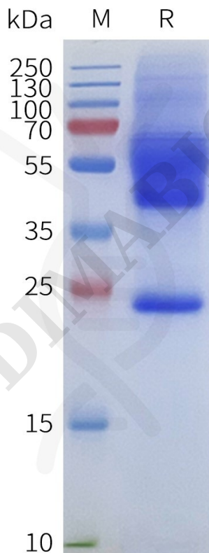
Figure 2. Human ACKR1-Strep-Nanodisc, C-Flag&Strep Tag on SDS-PAGE