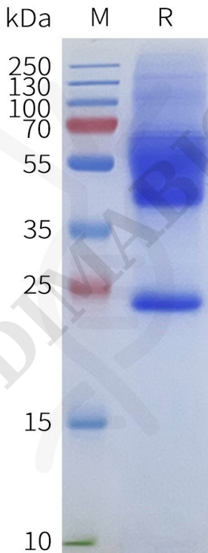
Figure 2. Human ACKR1-Strep-Nanodisc, C-Flag&Strep Tag on SDS-PAGE