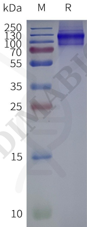
Figure 2. Human CHRM3-Strep-Nanodisc, C-Flag&Strep Tag on SDS-PAGE