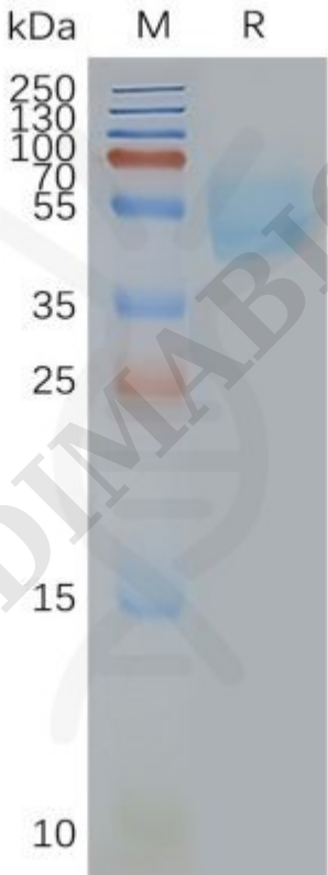
Figure2. Human ADORA2A-Nanodisc, Flag Tag on SDS-PAGE