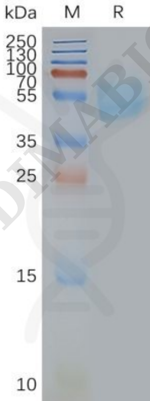
Figure2. Human ADORA2A-Nanodisc, Flag Tag on SDS-PAGE