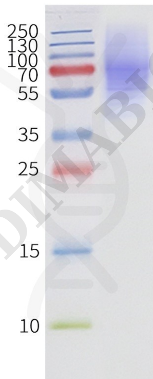
Figure 2. Human ADRB3-Strep-Nanodisc, C-Flag&Strep Tag on SDS-PAGE