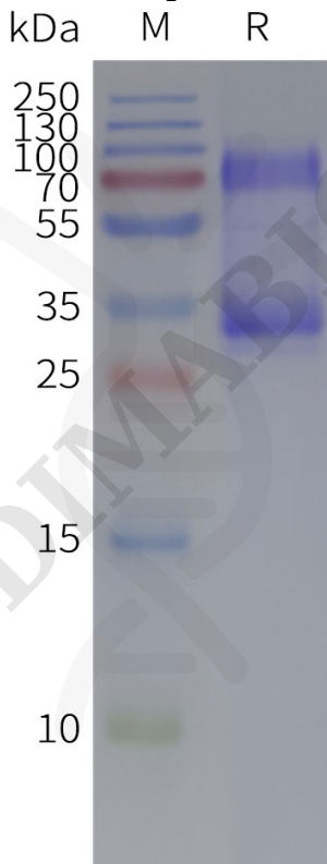
Figure 2. Human ADGRG3-Strep-Nanodisc, C-Flag&Strep Tag on SDS-PAGE