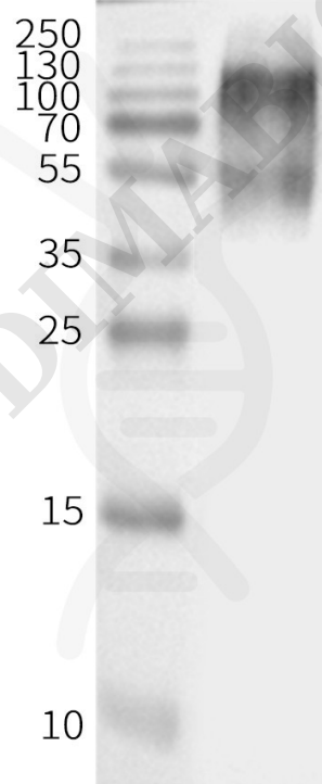
Figure 2. WB analysis of Human AGTR2-Strep-Nanodisc with Strep-Tactin HRP at 1/4000 dilution