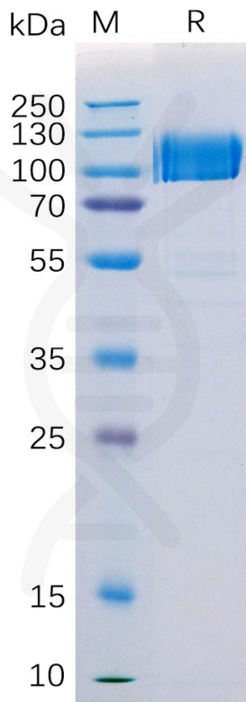
Figure 1. Human AXL Protein, hFc Tag on SDS-PAGE under reducing condition.