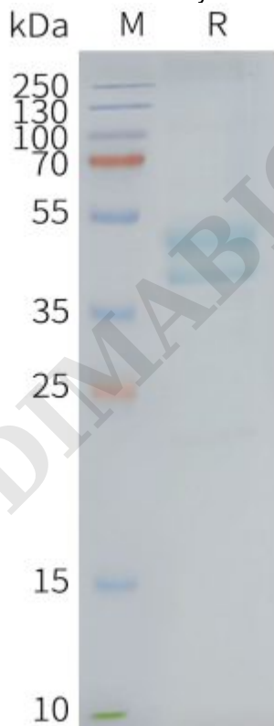
Figure2. Human C5AR1-Nanodisc, Flag Tag on SDS-PAGE