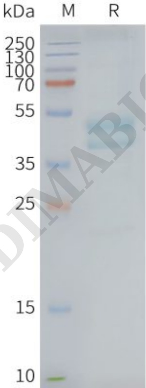
Figure2. Human C5AR1-Nanodisc, Flag Tag on SDS-PAGE