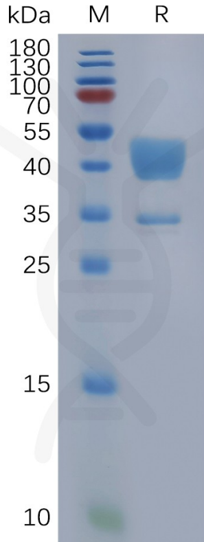
Figure 1. Human C5AR1 Protein, hFc Tag on SDS-PAGE under reducing condition.