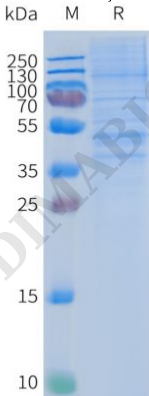
Figure2. Human CCR2-Nanodisc, Flag Tag on SDS-PAGE