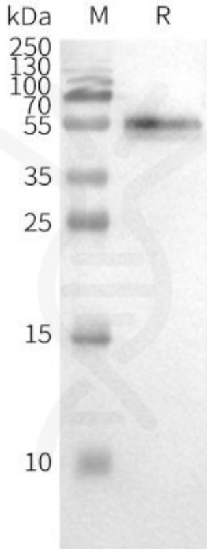
Figure3. WB analysis of Human CCR2-Nanodisc with anti-CCR2 monoclonal antibody (BME100087), followed by Goat Anti-Human IgG HRP at 1/5000 dilution