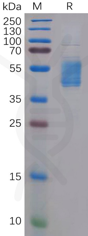
Figure 1. Human CCR4 Protein, hFc Tag on SDS-PAGE under reducing condition.