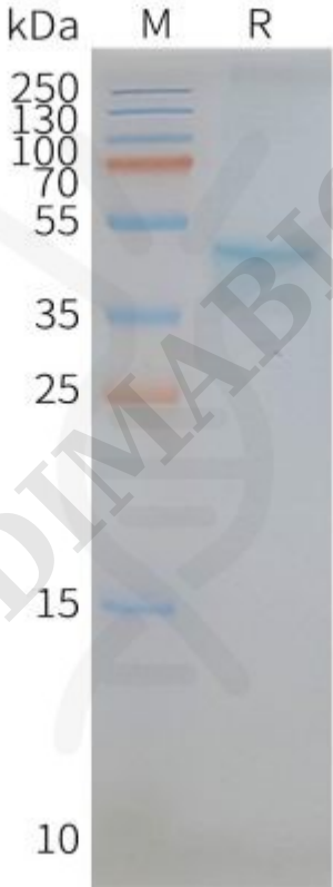
Figure2. Human CCR5-Nanodisc, Flag Tag on SDS-PAGE