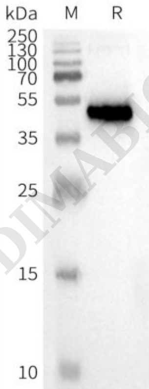
Figure2. WB analysis of Human CCR8-Nanodisc with anti-CCR8 monoclonal antibody (BME100115) at 1µg/ml, followed by Goat Anti-Human IgG HRP at 1/5000 dilution