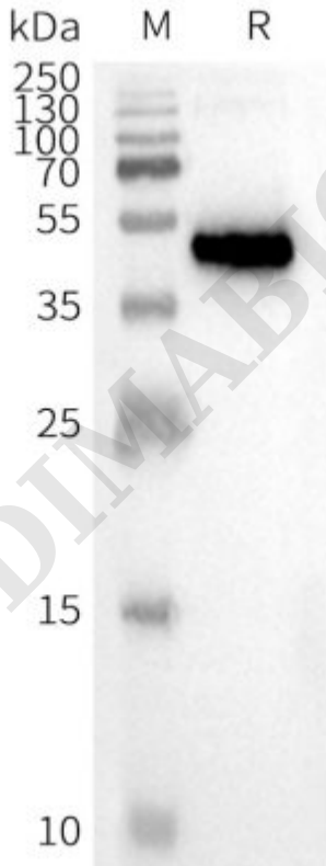
Figure2. WB analysis of Human CCR8-Nanodisc with anti-CCR8 monoclonal antibody (BME100115) at 1 \mu g/ml, followed by Goat Anti-Human IgG HRP at 1/5000 dilution