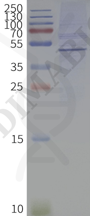
Figure 2. Human CCR8-Strep-PeptiNanodisc, C-Flag&Strep Tag on SDS-PAGE