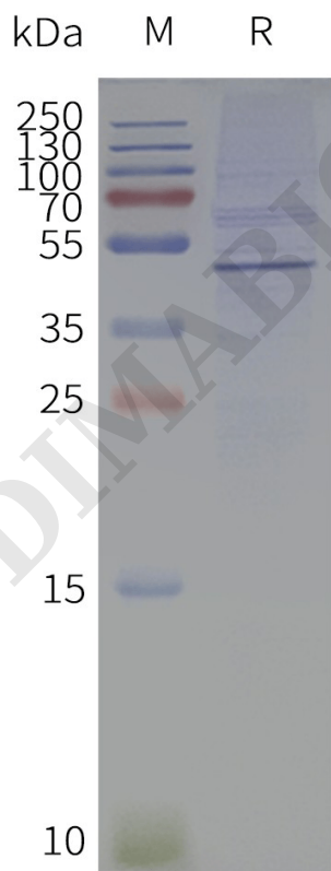
Figure 2. Human CCR8-Strep-PeptiNanodisc, C-Flag&Strep Tag on SDS-PAGE