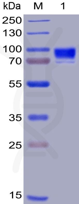
Figure 1. Human CD123, hFc-His Tag on SDS-PAGE under reducing condition.