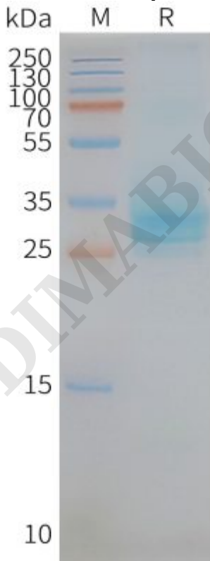
Figure2. Human CD151-Nanodisc, Flag Tag on SDS-PAGE