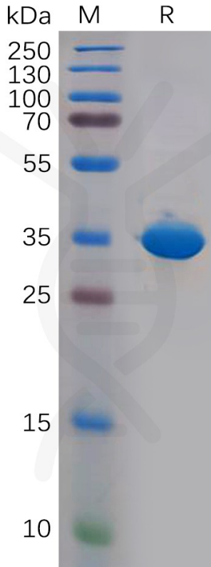
Figure 1. Human CD81 Protein, hFc Tag on SDS-PAGE under reducing condition.