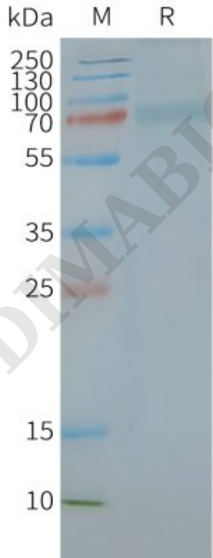
Figure2. Human CGRPR-RAMP1-Nanodisc, Flag Tag on SDS-PAGE