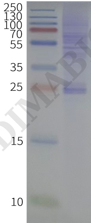
Figure 2. Human CLDN18.1-Strep-PeptiNanodisc, C-Flag&Strep Tag on SDS-PAGE