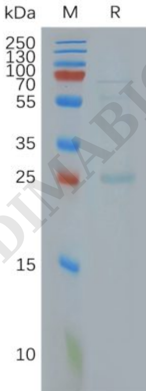
Figure2. Human CLDN18.2-Nanodisc, Flag Tag on SDS-PAGE