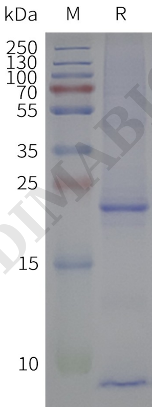
Figure 2. Human CLDN6-Strep-PeptiNanodisc, C-Flag&Strep Tag on SDS-PAGE