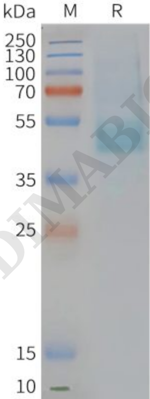
Figure2. Human CMKLR1-Nanodisc, Flag Tag on SDS-PAGE