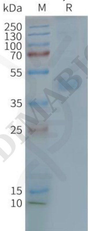
Figure2. Human CX3CR1-Nanodisc, Flag Tag on SDS-PAGE