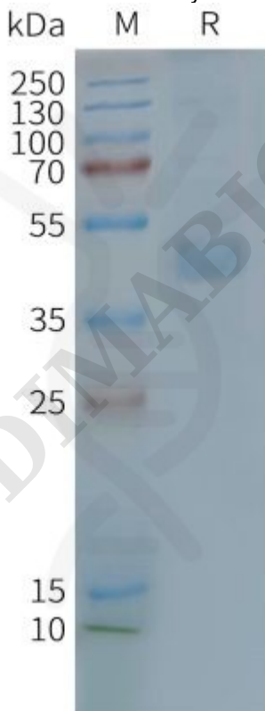
Figure2. Human CX3CR1-Nanodisc, Flag Tag on SDS-PAGE