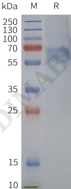
Figure 2. Human DRD5-Strep-Nanodisc, C-Flag&Strep Tag on SDS-PAGE