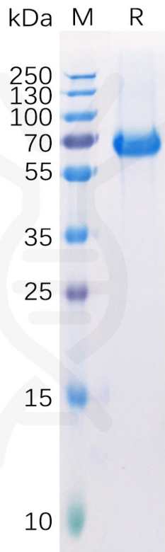
Figure 1. Human EPHA2 Protein, His Tag on SDS-PAGE under reducing condition.