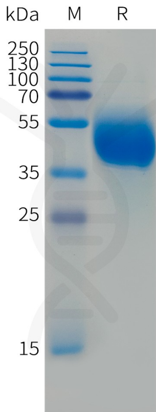
Figure 1. Human FCRL5(745-847) Protein, hFc Tag on SDS-PAGE under reducing condition.