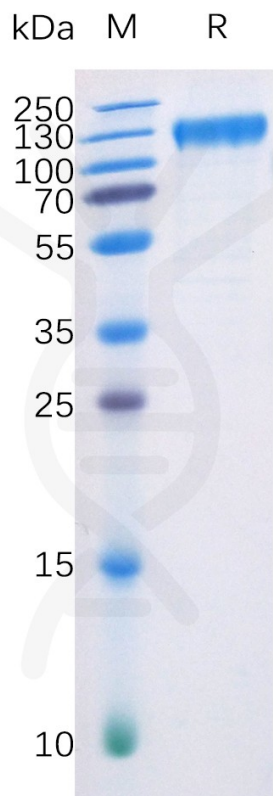
Figure 1. Human FLT3, hFc-His Tag on SDS-PAGE under reducing condition.

0.2 \mu g of Human FLT3LG, mFc-His Tagged protein per well