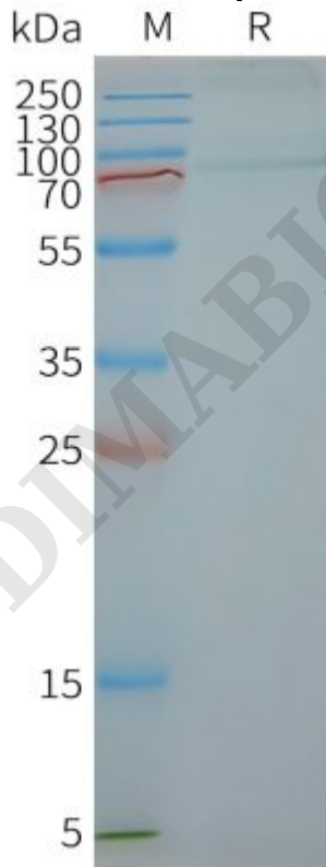
Figure2. Human FSHR-Nanodisc, Flag Tag on SDS-PAGE