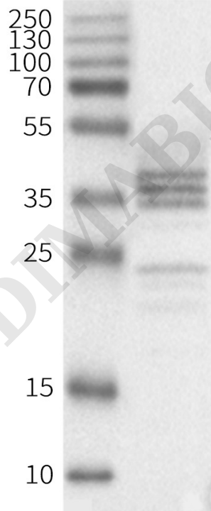
Figure 2. WB analysis of Human GNRHR-Strep-Nanodisc with Strep-Tactin HRP at 1/4000 dilution