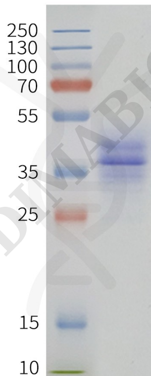
Figure 2. Human GPR15-Strep-Nanodisc, C-Flag&Strep Tag on SDS-PAGE