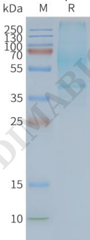
Figure2. Human GPR20-Nanodisc, Flag Tag on SDS-PAGE