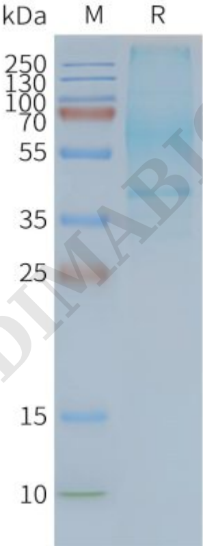
Figure2. Human GPR20-Nanodisc, Flag Tag on SDS-PAGE