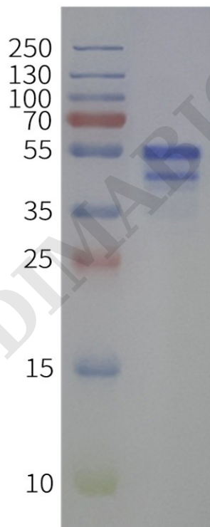
Figure 2. Human GPR65-Nanodisc, Flag Tag on SDS-PAGE