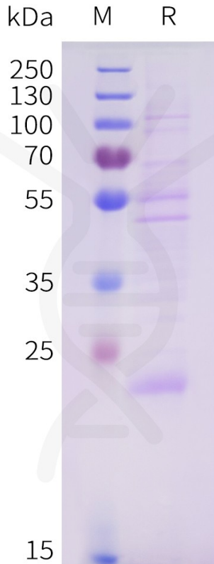
Figure 1. Human IL11 Protein, Flag Tag on SDS-PAGE under reducing condition.