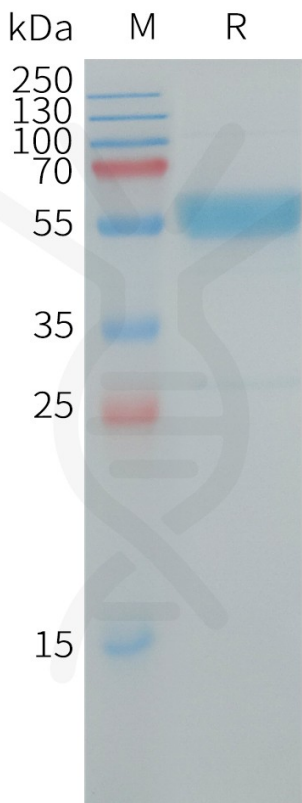
Figure 1. Human IL19 Protein, hFc Tag on SDS-PAGE under reducing condition.