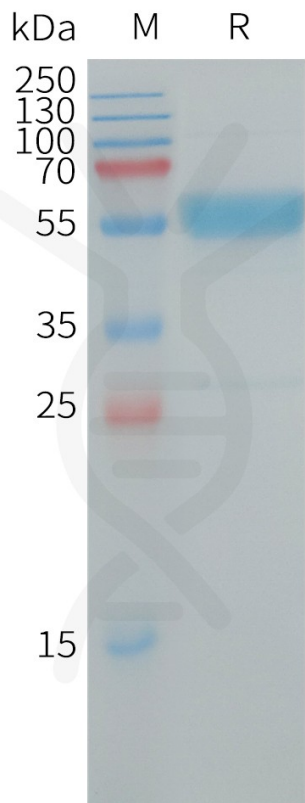
Figure 1. Human IL19 Protein, hFc Tag on SDS-PAGE under reducing condition.