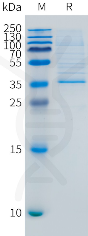
Figure 1. Human LY6E Protein, hFc Tag on SDS-PAGE under reducing condition.