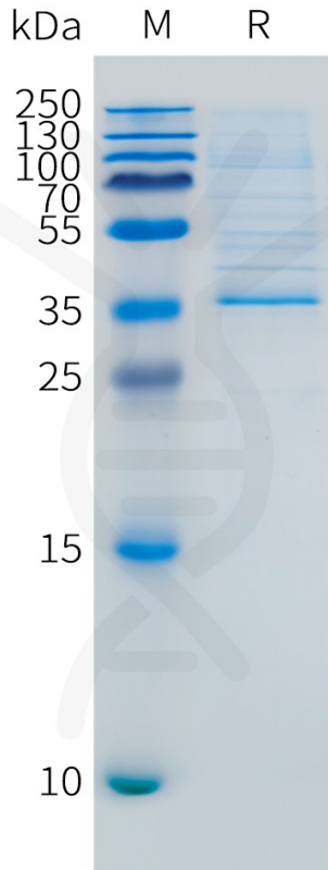
Figure 1. Human LY6E Protein, hFc Tag on SDS-PAGE under reducing condition.