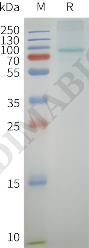
Figure 2. Human MBP-AGTR1-Nanodisc with N-MBP Tag, C-Flag Tag on SDS-PAGE