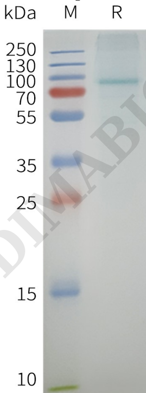
Figure 2. Human MBP-AGTR1-Nanodisc with N-MBP Tag, C-Flag Tag on SDS-PAGE